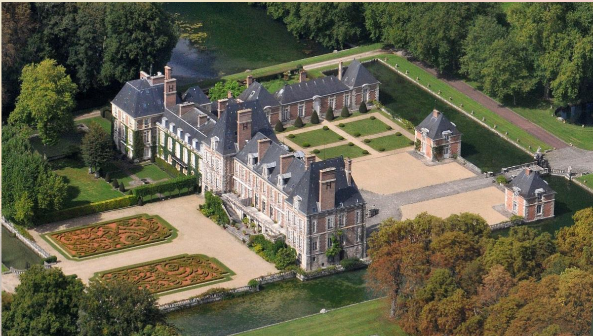
Courances Castle in one of France's most beautiful parks.