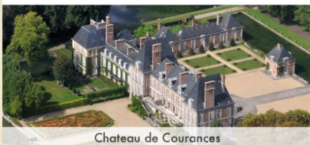
Chateau de Courances